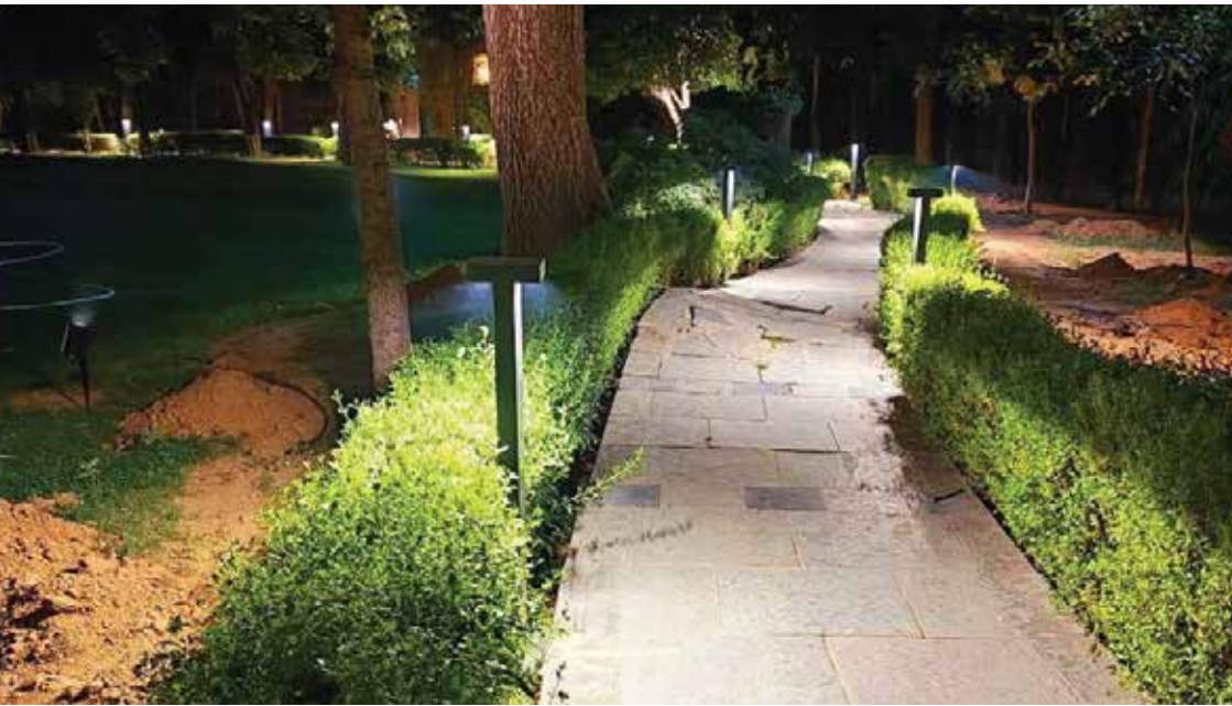
PRIVATE FARM HOUSES, DELHI