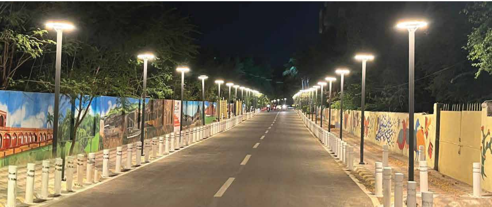
G20, JAIPRAKASH NAGAR, NAGPUR