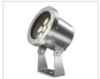
LED Fountain Light