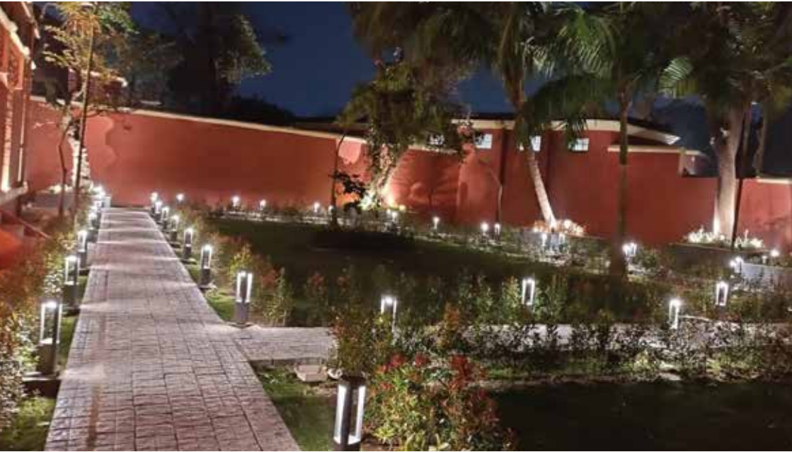
ALIPORE JAIL MUSEUM, KOLKATA