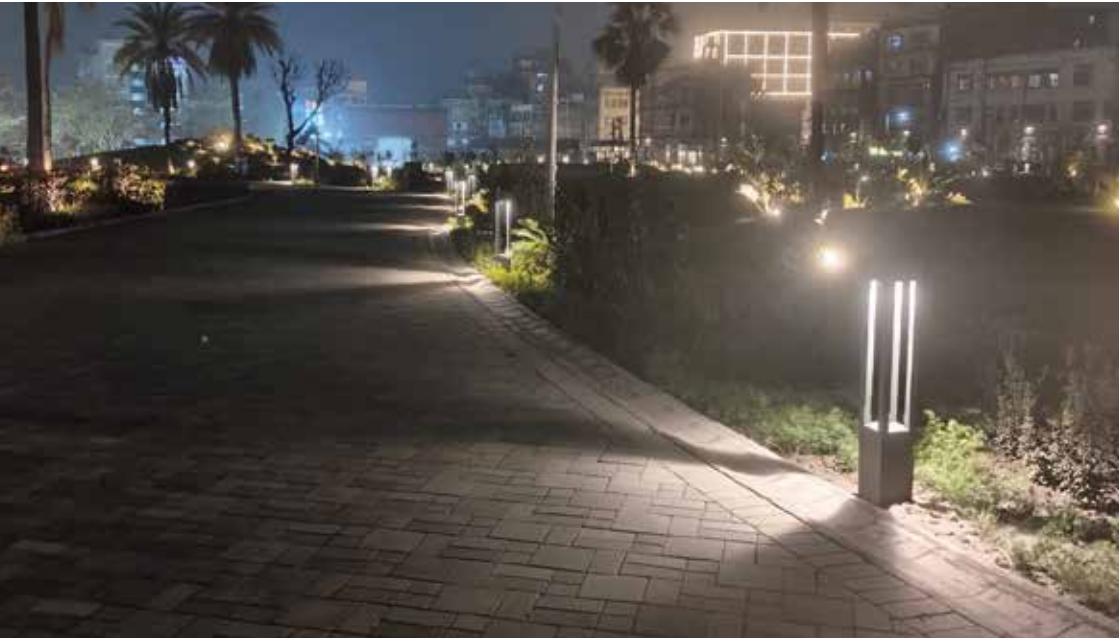
BOTANICAL GARDEN PARK, GUWAHATI