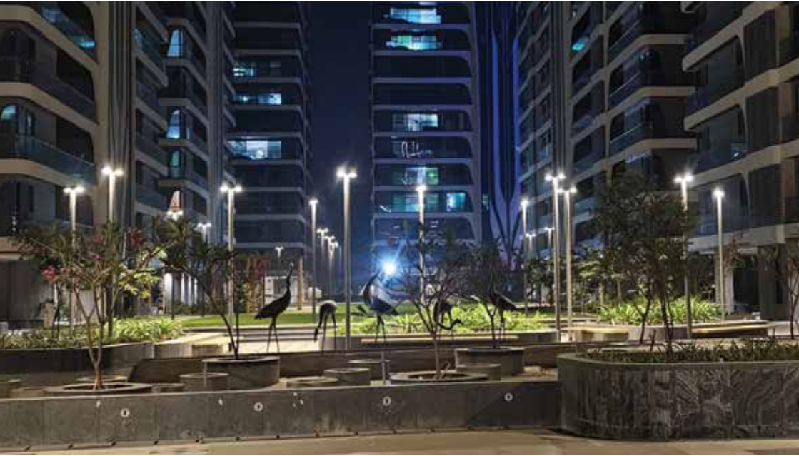
RAJHANS CREMONA, SURAT, GUJARAT