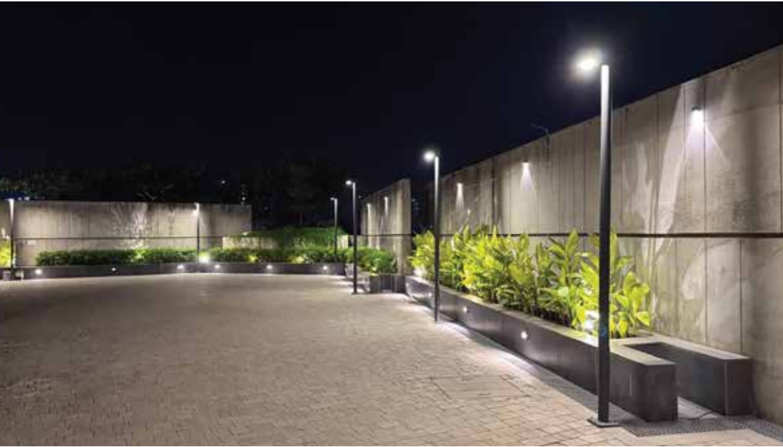
DECORA VOGUE, GUJARAT