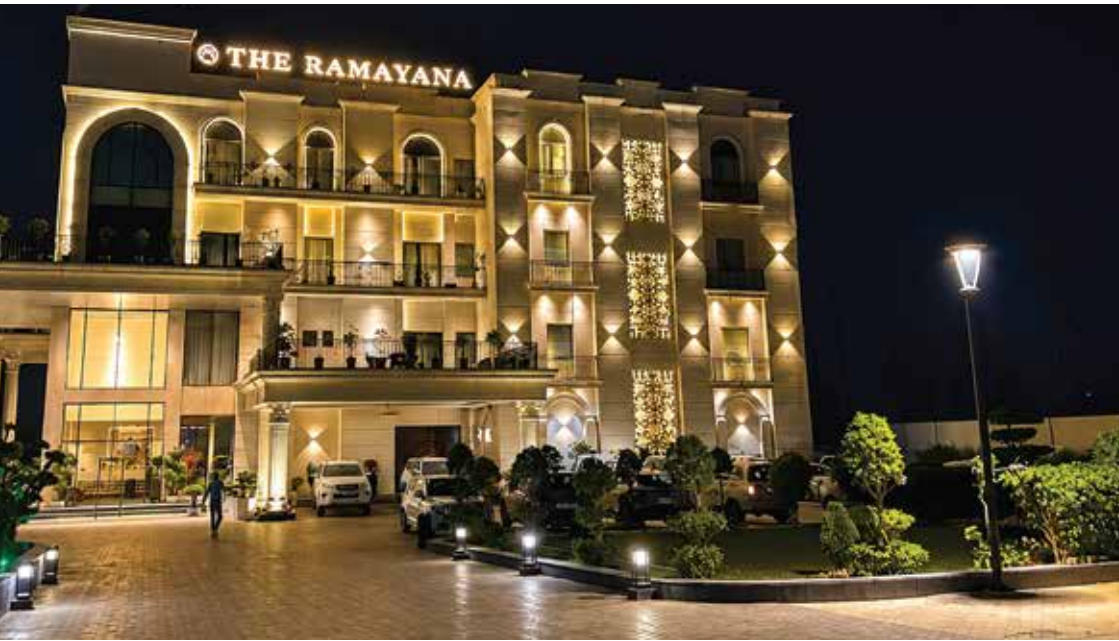
THE RAMAYANA HOTEL, AYODHYA