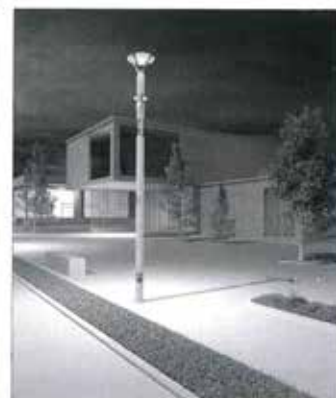
SMART LIGHTING POLE WITH LIGHTING