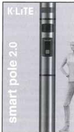
SMART LIGHTING POLE

K-Lite proudly announces the introduction of smart city poles ( Intelligent poles) with its modular solution, to cater to the above needs in the upcoming smart cities with the salient features as below: